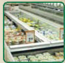
Large-capacity unit 大容量设计