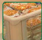
Slim handle 超薄把手