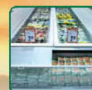
Night Blind 手翻夜帘