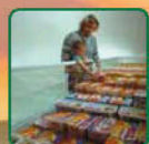
Easy product accessibility 存取方便