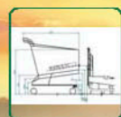
Passive bumper rail 多功能防撞条